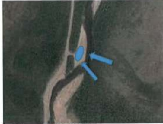
Figure 2. 7 Mile Pit

Gravel will be loaded into an end dump truck with a front end loader. When we have moved to the next pit the stock pile area will be dozed at a downward slope toward the river's edge. There will be no need for revegetation as this is a gravel beach and currently has no vegetation