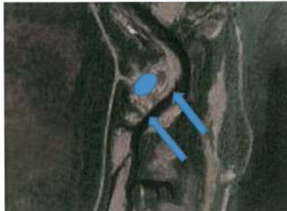
Figure 4. 14 Mile Pit