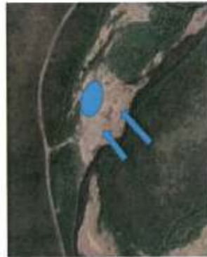
Figure 3. 12 Mile Beach

Gravel will be loaded into an end dump truck with a front end loader. When we have moved to the next pit the stock pile area will be dozed at a downward slope toward the river's edge. There will be no need for revegetation as this is a gravel beach and currently has no vegetation.