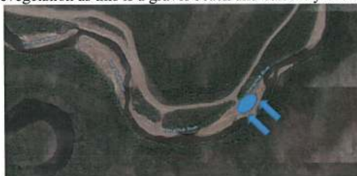
Figure 1. 3 Mile Beach material site

Gravel will be loaded into an end dump truck with a front end loader. When we have moved to the next pit the stock pile area will be dozed at a downward slope toward the river's edge. There will be no need for revegetation as this is a gravel beach and currently has no vegetation.