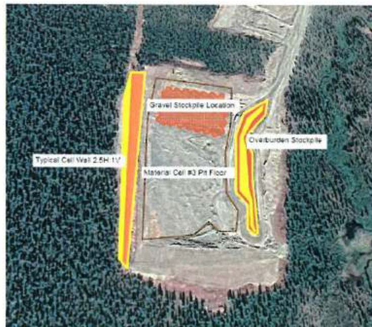
Figure 2. Site Plan for Material Site A-1.

Equipment will be removed from the site along with any plastic or other materials used during mining.