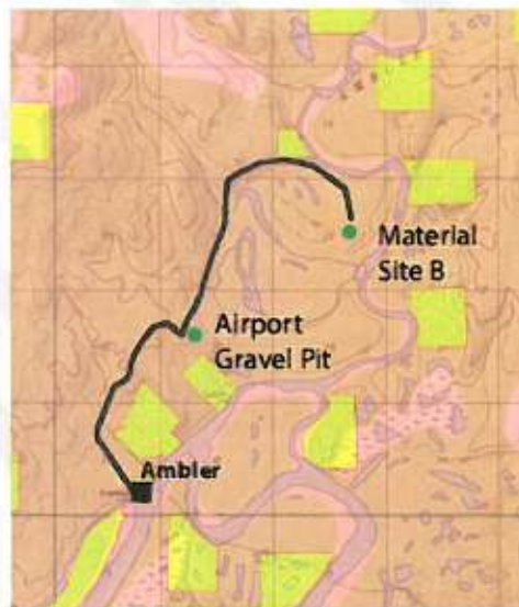
Figure 1. Active Ambler Gravel Pits

This permit application did not include gravel extraction. The project will make use of already extracted and stockpiled gravel from Material Site B (see Figure 1 ) that was performed under Title 9 Conditional Use Permit #105-03-21. This use permit does not provide for gravel extraction, rather its scope is the placement, design and land use activities associated with multipurpose community office facility construction.