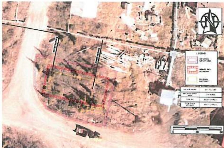
Figure 2. Noorvik Village Office Building Service Lines

Once the building sections are complete, stairs, ramps, and landings for each entrance of the building will be placed. At this time, water, sewer, and electrical utility connections will be installed completing respective tie-in to the community system. The sewer utility service will comprise of gravity fed arctic pipe placed on lumber (see Figure 2. ) The water utility service will comprise of two 1" PEX lines run inside arctic pipe and will cross Fireweed Drive (see Figure 2. )