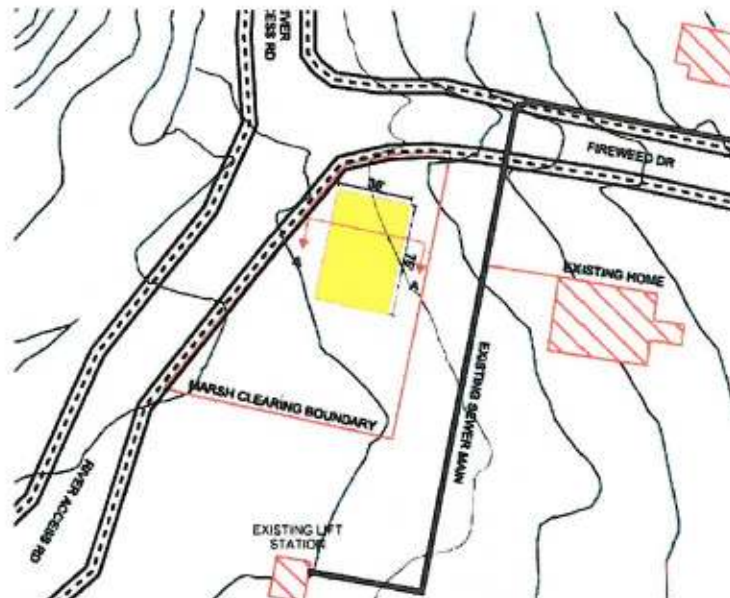
Figure 1. Location of Noorvik Village Office Building

Approximately 0.14 acres of wetlands shall be cleared prior to gravel placement. 585 cubic yards of fill material (Type A) from the Hotham Peak Pit will be placed at the corner of Fireweed Drive and River Access Road (see Figure 1. )