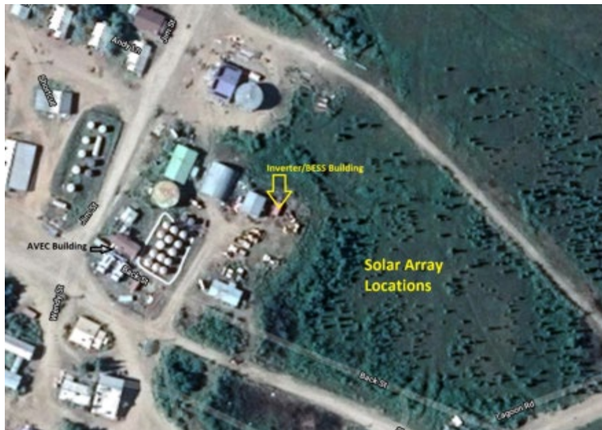
Figure 1. Solar Array site location near existing power plant

The site is near the existing power plant, within the community of Shungnak in the Village Zone. The City of Shungnak is the landowner.